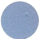
Sky Blue M237