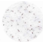
Desert Stone S406