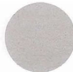
Dove Stone S400