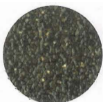
Starry Night S225