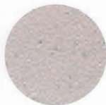
Canyon Granite M244