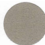
Caribbean Sage*** M229