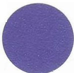
Charcoal Gray* S215