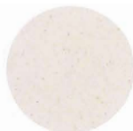
Deep Blue S203